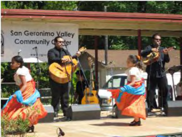
Musicians and dancers from Los Cenzontles Mexican Arts Center performed at their bilingual Mexican Arts Festival in June which attracted hundreds of visitors.

The finest local creative talent and artists from around the world are brought to the Valley -- music, painting, sculpture, photography, comedy, plus outstanding cultural events. Emerging artists have opportunities to showcase their talent and to actively participate in arts activities. We conducted in-depth interviews with a cross-section of our community in connection with our Marin Community Foundation Audience Development Grant as we look for ways to extend and deepen artistic appreciation, experience and expression.